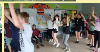
From left: Students in 8-1 pose outside and students in Ms. Gillmor's PE classes have fun dancing!