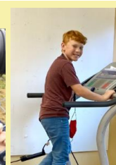
Bobcats, Out & About